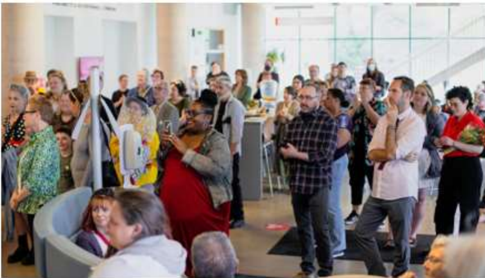
Opening Reception at the Marilyn I. Walker School of Fine and Performing Arts/Brock University