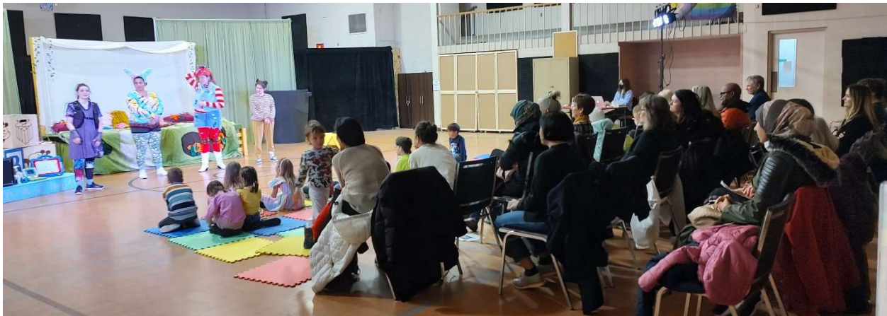
The Velveteen Rabbit in the Arts Education Centre, March 25, 2023